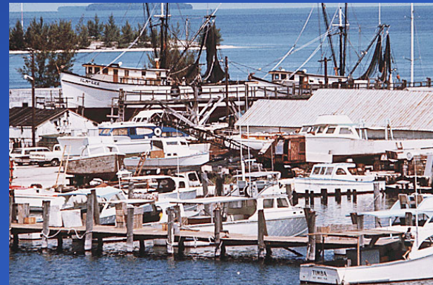
Key West (1972)