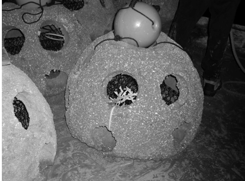
Figure 3. Reefdisks with 'large' coral fragments attached and ready for deployment